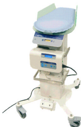
Figure 5. The LifeStart® trolley manufactured by Inditherm (October 2012)

This trolley was marked with the Conformité Européenne (CE) logo in October 2012 and is now marketed by Inditherm as ‘LifeStart®’.