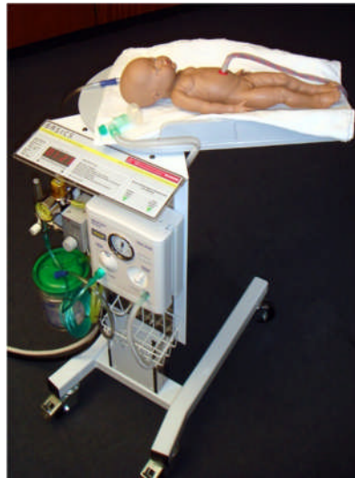
Figure 4. The first BASICS prototype (by PW in April 2011). Note that the problem of how to keep the baby warm was still not resolved

A key problem for the first prototype was how to keep the baby warm. Traditional resuscitators have an overhead heater, but this was not practical for a trolley designed to go under the legs of a woman in lithotomy position or over an operating table. A commercial company (Inditherm plc) was identified by DH and approached to adapt their heated mattresses for the trolley. The company then agreed to collaborate on further development, with the aim of taking the product to market.